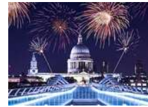
Murray Income Trust: Celebrating 100 years abrdn