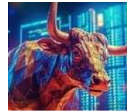
Despite turbulence, transition to a bond bull continues. PGIM