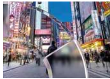
Market rotations don't change long-term growth trends J.P. Morgan Asset Management