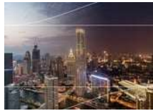
Markets never close. Why should you? State Street Corporation