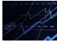
Quality Dividend Growth: Building a portfolio on strong foundations WisdomTree